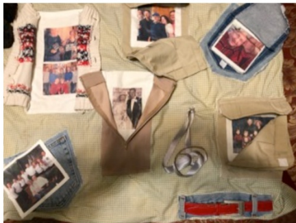
Sample Activity/Fidget Mats

The confirmation class of St. Paul's/St. Elim's Lutheran Churches submitted a picture of a sample fidget mat for their project, "Alzheimer's Fidget Mats."