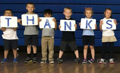
Trinity Lutheran School raised $4,372 during the 2018 Big Give to help purchase Chromebooks for its third grade students.

MEDIA SPONSORS Fremont Tribune KHUB-KFMT Radio