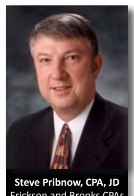
Erickson and Brooks CPAs

A. Occasionally, clients will bring up the subject of creating a private foundation. Although, as with almost any tax-implicated question, a private foundation might be the best answer for a particular client's situation, there are many times when a donor-advised fund at the Foundation is a better choice for the client. The costs of setup and maintenance of a donor-advised fund are often less, usually